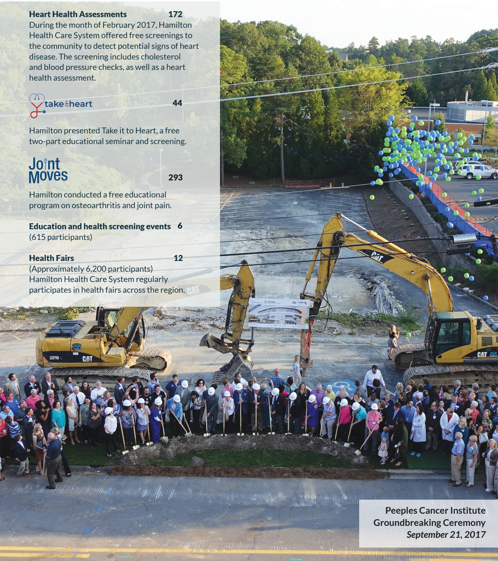
Peoples Cancer Institute Groundbreaking Ceremony September 21, 2017